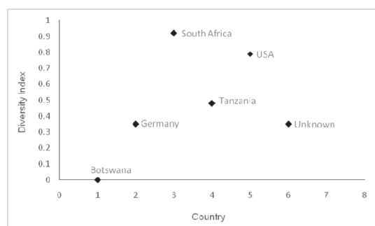
Figure 1. Qualitative morphological traits showing the diversity of geographical regions in the biplot

Southern Africa. The genus Amaranthus is one of the neglected and underutilized plant species common in farming systems in the Southern African region. It includes several grain and leafy species widely distributed in South and Southern Africa, usually occurring as a weed in crop fields and eaten by various communities as spinach. The ALVs are important sources of vitamins and minerals in the rural communities. Some of the important Amaranthus species occurring in South Africa are A. hybridus , A. thunbergii , A. spinosus , A. deflexus , A. hypochondriacus , A. viridus and A. greazicans (Jansen van Rensburg et al., 2007). Although Amaranthus is an important food in the subsistence sectors in Southern Africa, little breeding work has been conducted to improve the nutritional value and yield (Gerrano et al., 2015). To supplement and complement the starchy staple meals, resource poor farmers mostly consume the cultivated species of Amaranthus and their wild relatives. A small amount is sold for income generation. It is generally regarded to be a good source of vitamins A and C, iron, calcium, potassium and essential amino acids, including lysine, and, thus, it is an important food source for people who are nutritionally vulnerable (Uusiku et al., 2010), hence the need for breeding research.