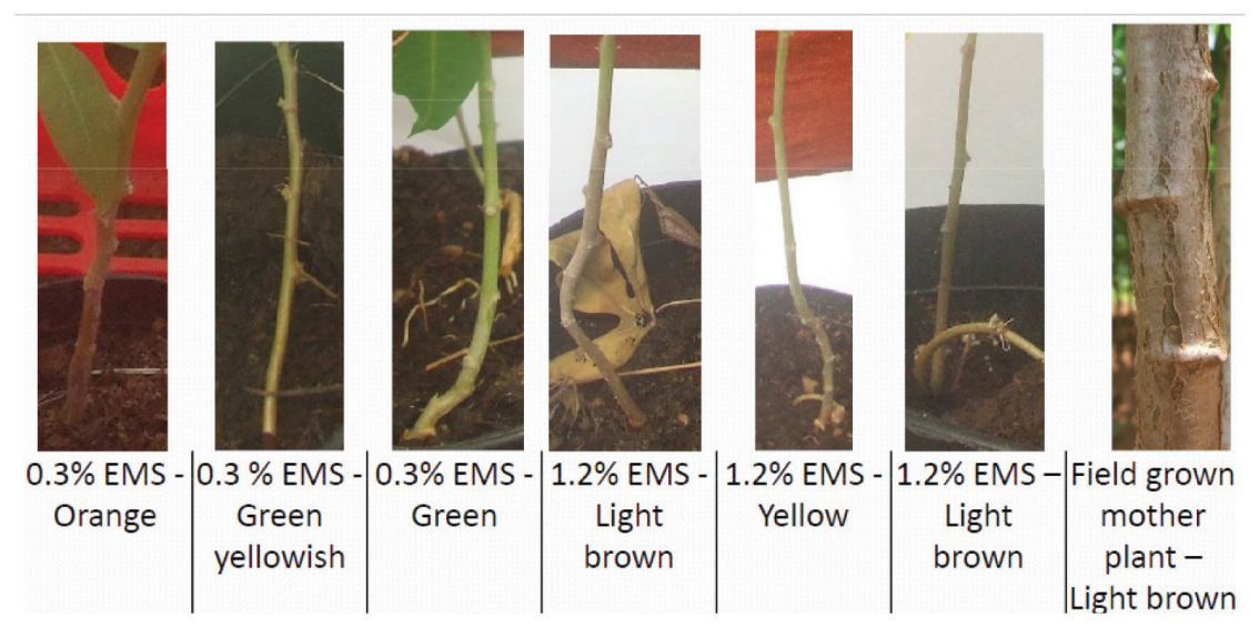
Plate 2. Variation in stem colour of in vitro mutants of Sree Jaya at three months after planting out