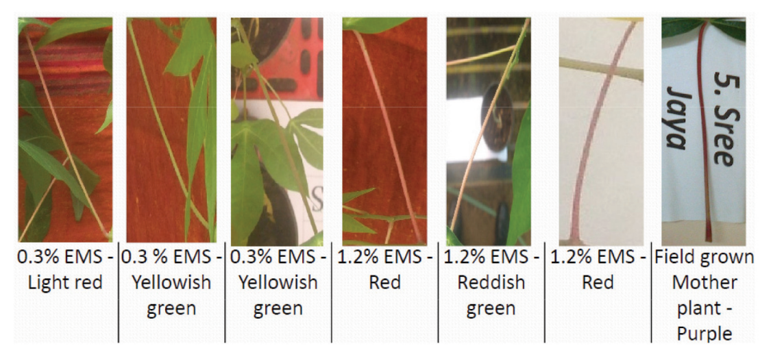
Plate 1. Variation in petiole colour of in vitro mutants of Sree Jaya at three months after planting out

The evaluation of qualitative traits at three months after planting showed that there are variations in colour of petiole stipule, emerging leaf and stem as presented in Table 8. In Sree Jaya, the wild type was having petiole colour purple while in the mutated plants there were light red, yellowish green, pink and red coloured petiole. Stipule colour changed from light green of the wild type to purplish green in few mutated plants while others had light green stipule colour. Emerging leaf colour in the