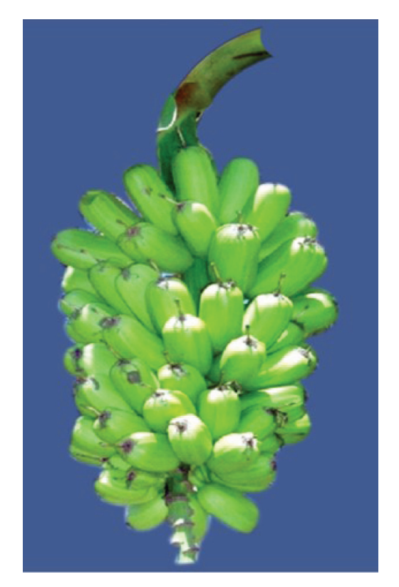
Plate 1.Popoulu bunch