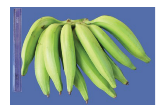
Plate 5. ManjeriNendran II hand