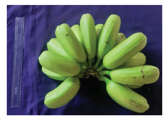
Plate 2. Popoulu hand