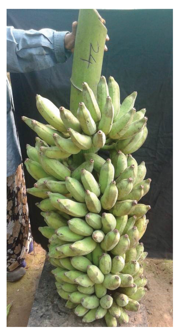
Plate 7. Kluai Namwa Khom bunch

was 23 to 25 days earlier than Manjeri Nendran and Nendran respectively. Both the plantains, Manjeri Nendran II as well as Nedunendran were statistically similar for days to bunching. Popoulu had shorter crop duration which was on par with Nedunendran, while Manjeri Nendran II took 359.38 days from planting to harvest. Considering yield characters, Popoulu recorded 16.01 kg bunch weight per plant and a yield of 39.89 t/ha, followed by Manjeri Nendran II and Nedunendran (Plates 1 and 4). This implies an additional yield of 23% from Popoulu when compared to the next best cultivar in the state viz. , Manjeri Nendran II. Menon et al. (2014) reported a crop duration of 298 days in 'Popoulu' which was the shortest when compared to all other