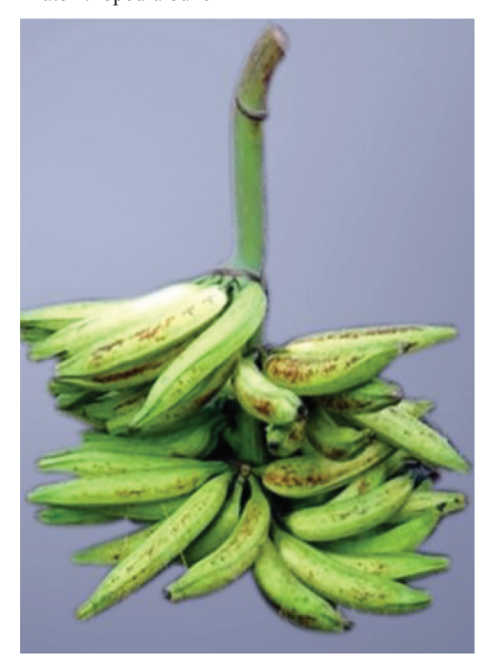
Plate 4. Manjeri Nendran II bunch