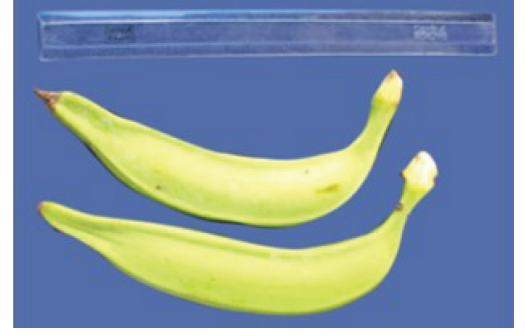
Plate 6. ManjeriNendranIIfingers