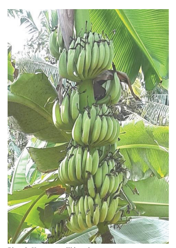
Plate 8. Karpooravalli bunch tested checks (311 to 358 days) belonging to the AAB genome.

was 23 to 25 days earlier than Manjeri Nendran and Nendran respectively. Both the plantains, Manjeri Nendran II as well as Nedunendran were statistically similar for days to bunching. Popoulu had shorter crop duration which was on par with Nedunendran, while Manjeri Nendran II took 359.38 days from planting to harvest. Considering yield characters, Popoulu recorded 16.01 kg bunch weight per plant and a yield of 39.89 t/ha, followed by Manjeri Nendran II and Nedunendran (Plates 1 and 4). This implies an additional yield of 23% from Popoulu when compared to the next best cultivar in the state viz. , Manjeri Nendran II. Menon et al. (2014) reported a crop duration of 298 days in 'Popoulu' which was the shortest when compared to all other